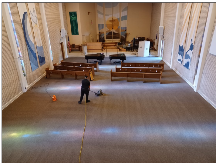
With help moving furniture from men in the Whiteside Manor addiction treatment program, the carpet in the sanctuary got a much-needed cleaning on Nov. 22 in preparation for our Advent and Christmas services.

"The Advent season is a season of waiting, but our whole life is an Advent season, that is, a season of waiting for the last Advent, for the time when there will be a new heaven and a new earth."