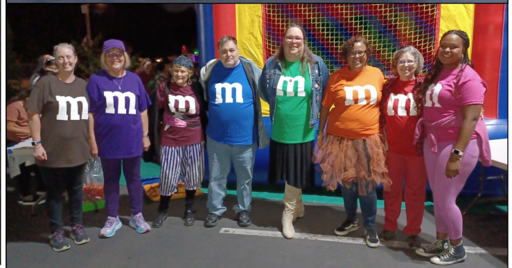
There were games and lots of M&M's there, too!