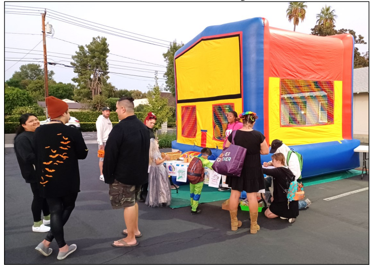
The bounce house was a new and popular attraction