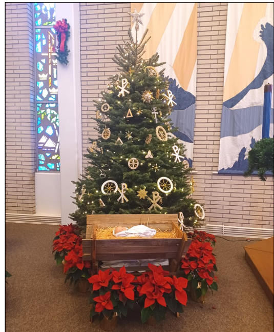
Christmas tree with Chrismon ornaments.