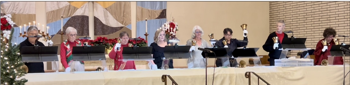
Our Christmas Eve services began with the handbell choir playing a delightful medley of Christmas carols.