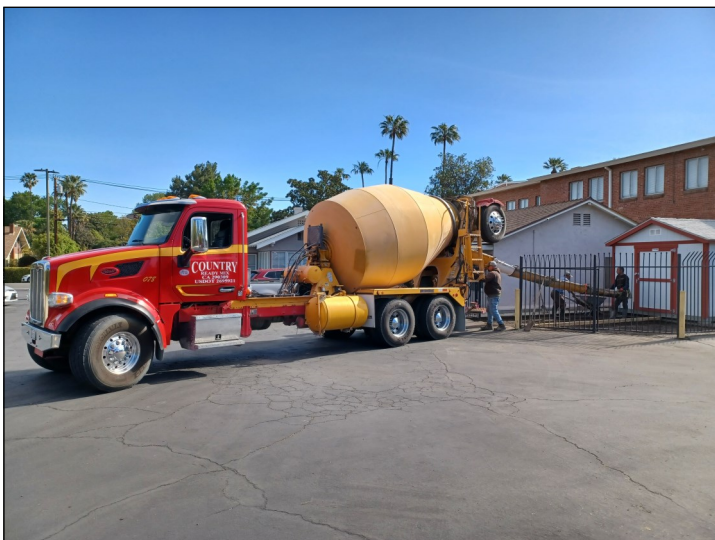
On April 5, a new concrete walkway was poured next to the storage shed to help our food pantry move carts of food more easily.