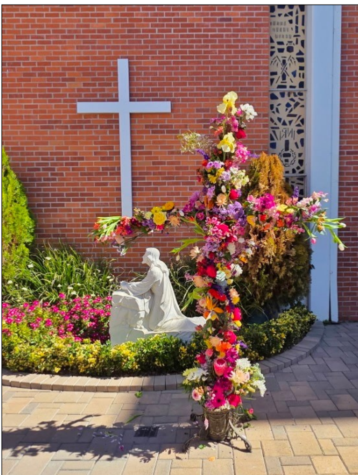
Christ is risen! He is risen indeed!