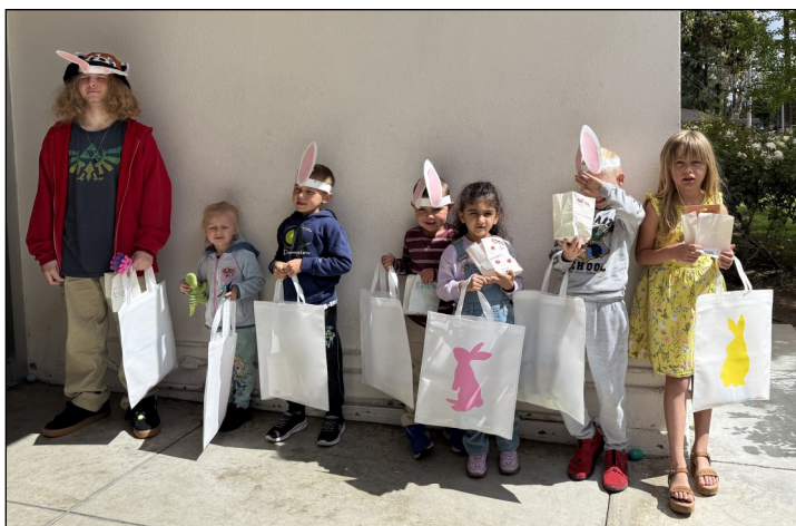
Kids of all ages enjoyed the Easter Egg Hunt on April 27!